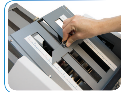
Pre-marked adjustable fold plates