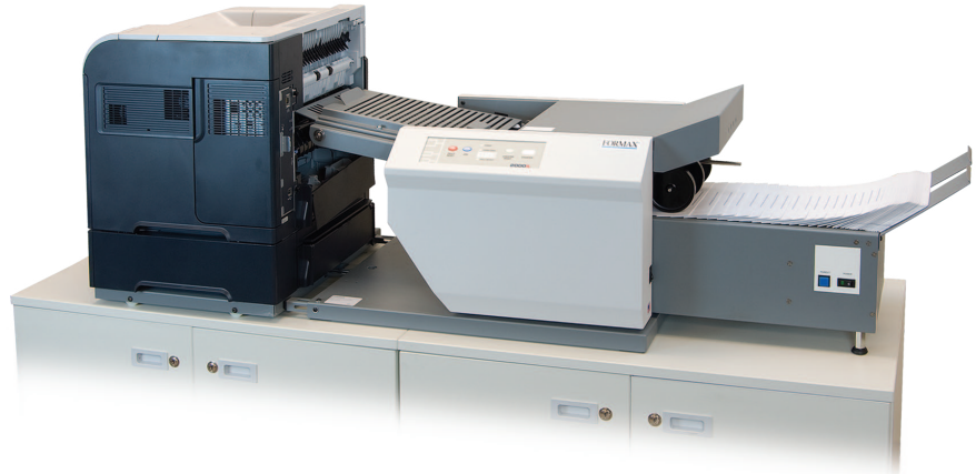
FD 2002IL System shown with IL Pressure Sealer and Alignment Base, laser printer (not included), and optional locking cabinets and 18" conveyor