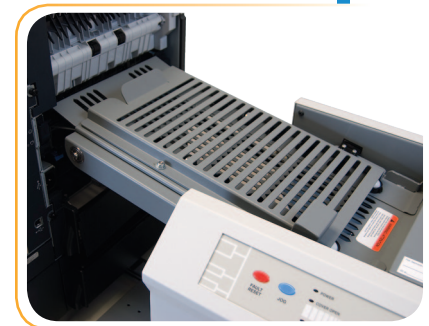
Enclosed paper path provides optimal document security

The FD 2002IL processes forms securely in a compact and powerful design. The user-friendly control panel features LED indicators and a six-digit resettable counter. The FD 2002IL is built in the USA with proven Formax strength and reliability.