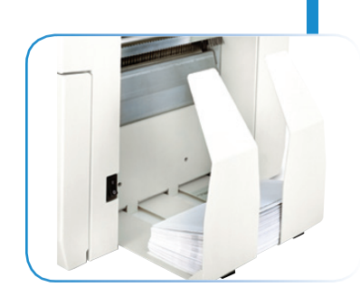
Standard Catch Tray