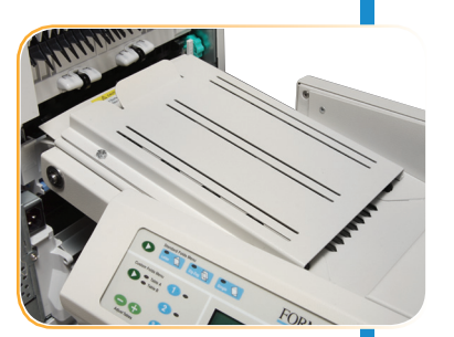
Enclosed paper path provides optimal document security

The AutoSeal IL System is easily installed. An IL-compatible desktop laser printer (see Specifications, below) is placed on the IL Alignment Base with the FD 2052IL pressure sealer using placement guides to ensure proper alignment. The IL Alignment Base incorporates an easy-pull system which allows the printer to be pulled away from the FD 2052IL to provide convenient access to the paper path and fold plates.