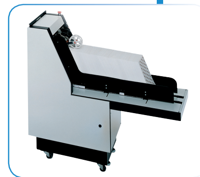
FD 2000-60 Bulk Input Loader (optional)