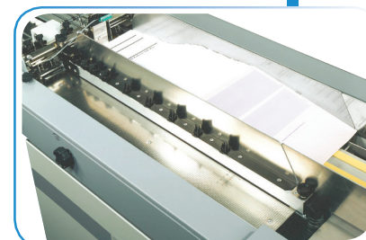
FD 2200 EX