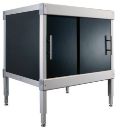
Height Adjustable Table

Having a strong stable table increases the life span of equipment and eliminates service activity related to weak, wobbly tables. Increase the life of your investment by providing a strong, stable platform.