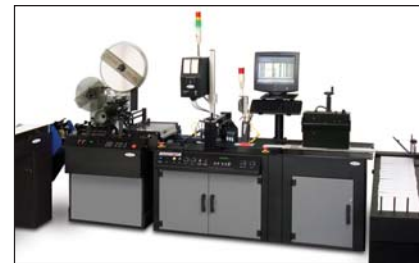
Above, Jet 1 Tabber shown in-line with mail transport including UltraFeed™ Feeder, Jet 1 Tabber, SIMS (Secap Ink Management System), Postnet Verifier, Printer Base, Dryer, Conveyor.