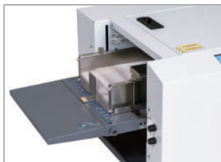
Air Suction Feed System