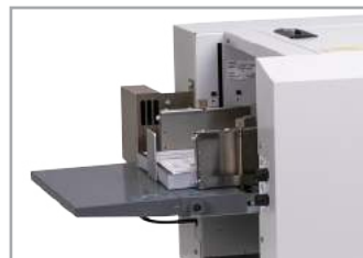
Side Air Blower