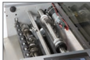
Rotary Action Creasing Assembly

Combines creasing and perforation in one simple yet powerful machine.