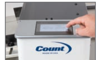
Touch Screen Controller

The COUNT™ iCrease Pro + is a robust solution for creasing and perforation of digital media to eliminate cracking when folding. Get all of the automation of bigger COUNT machines in a simple hand-feed machine anyone can use. The iCrease Pro + can crease and perf in one pass (no need to refeed!), with multiple crease locations and perfect bind covers, with choice of automatic hinge placement or no hinge.