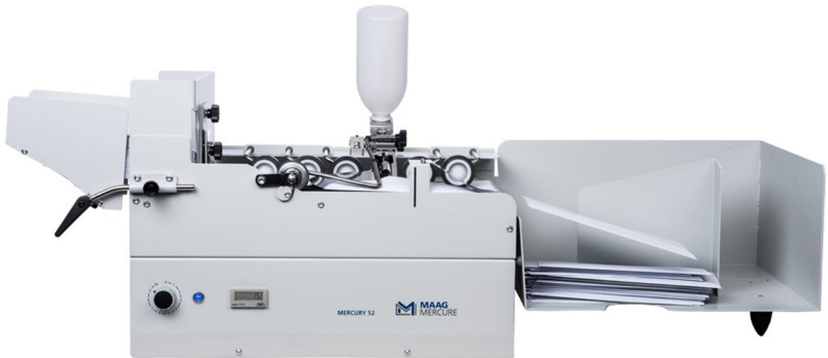
Shown: Standard Moistening Basin Assembly

Portable, Desktop Units are Clean and Quiet For Use in Any Office Environment or Department. The Mercury S2 IRC Sealers are Sturdy Enough to be Used in Production Environments.