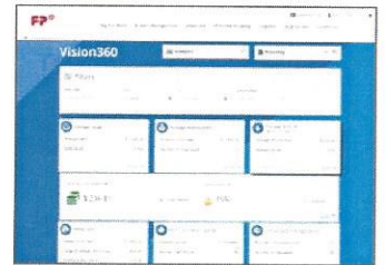
Postage and Ink

Expandable Tiles Provide Graphical Summary Views